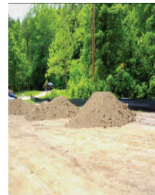
Ground breaking work begins at Hartshorne Pond. (Rt 13N)